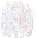
Christian Life Foundations

God is very specific about one of His purposes for every Christian who walks on the face of this earth. He commands every Christian to be about the work of edification . Godly edification is an outward, others-centered perspective. Inward, self centeredness kills edification.